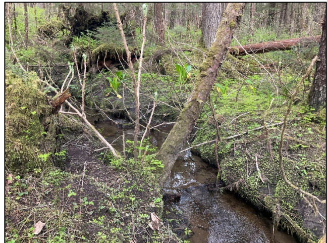
Figure 2.—Channel at waypoint 136.