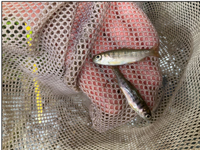
Figure 1.—Juvenile coho salmon captured at waypoint 136.